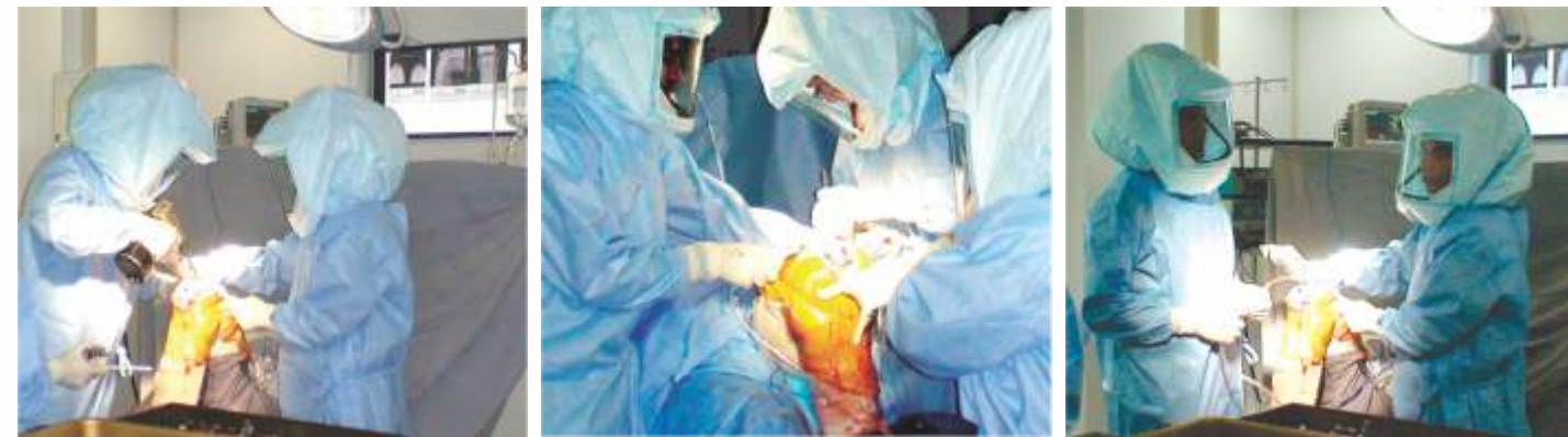
Live Telecast from Shalby Hospitals, Mohali